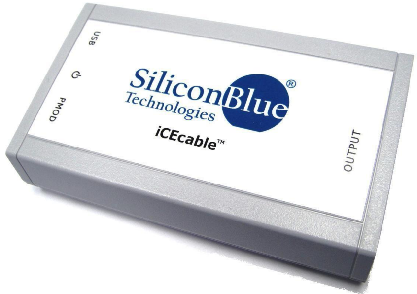
Figure 1: iCEcableM100-01